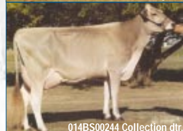
014BS00244 Collection dtr.