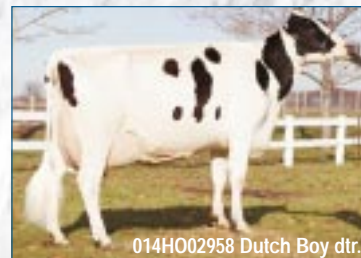
014H002958 Dutch Boy dtr.