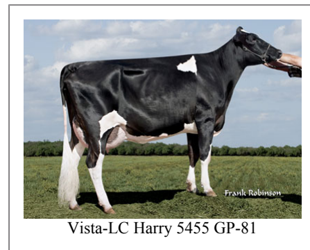
Vista-LC Harry 5455 GP-81