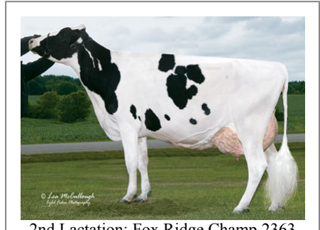
2nd Lactation: Fox Ridge Champ 2363 VG-85