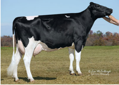
Bailie Champ 3333