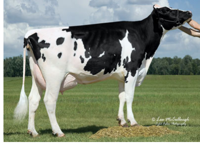
Valley View Champ 2197