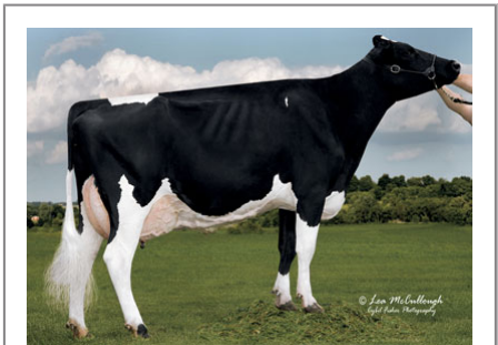
Dellen Champ Judy GP-81