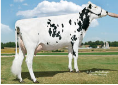
Tamarack-Valley Champ Caitlin GP-83