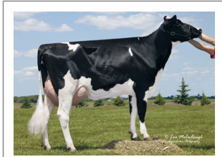
Vellma Farms Paxton Brandi GP-82